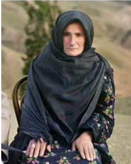
Public Domain - Representative photo